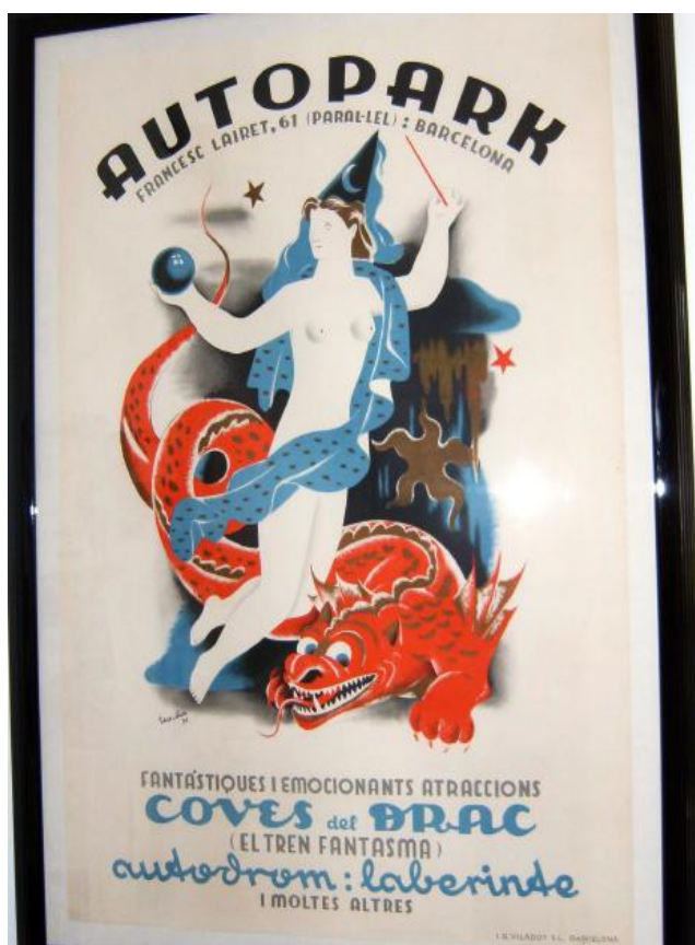
Vintage poster for amusement park with many "fantastic attractions"