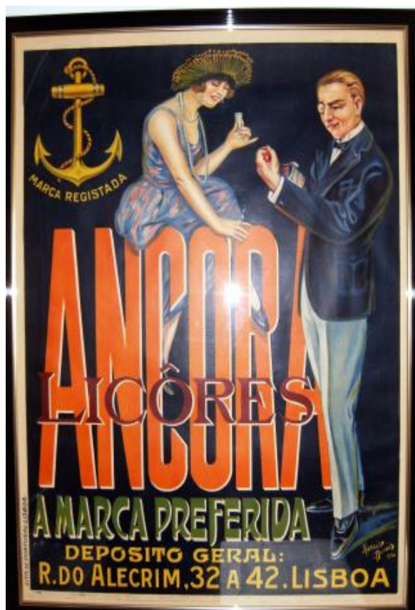
Vintage poster for "Preferred Brand" of Ancora Liqueur