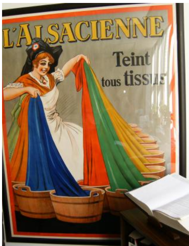
Vintage poster of Alsatian fabric dyer overseeing our favorite Merriam Webster's Third International Dictionary

Since 1973, we've been occupying the premises at 29 Broadway in New York City -- yes, just a few short blocks from the other Wall Street Occupiers -- and invite you to visit us to see what occupies our wall space in Suite 2301 -- scroll down to this month's LINGUAQUIZ question #3, below!