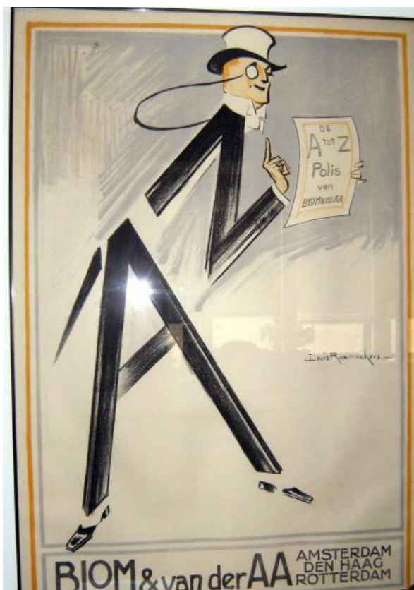
Vintage poster for "A-to-Z" insurance policy