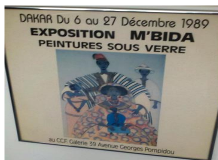
Poster on glass advertising exhibit of paintings on glass