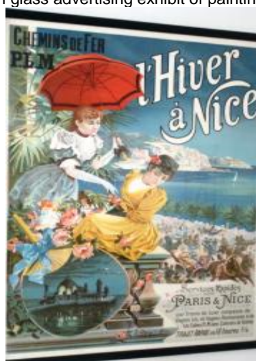
Poster for Winter train travel