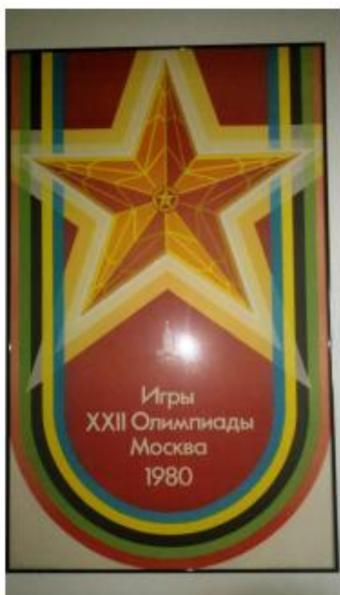
Travel poster for 1980 Olympics May we add that we are thankful for your business and wish you a terrific Thanksgiving Holiday!